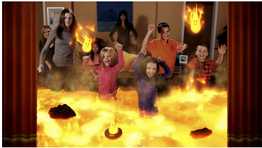
Figure 3: An example of an AR application on Xbox, Double Fine Happy Action Theater. As evidenced by this example, AR technologies are not necessarily wearable.