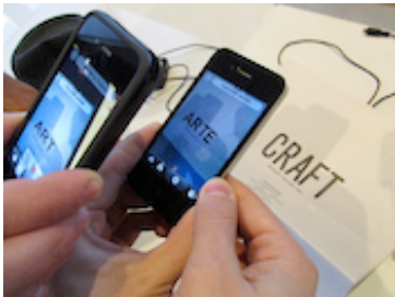
Figure 1: An example of AR functionality within a single application on a traditional platform, WordLens does real-time in-image translation.